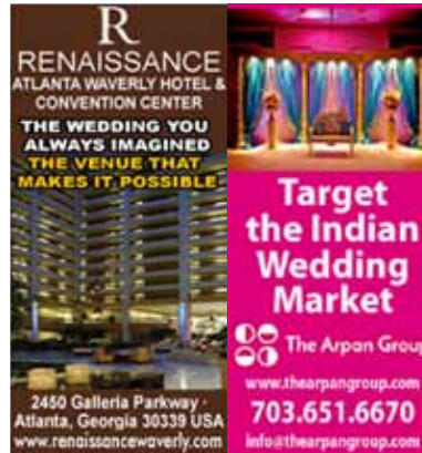
Sky Scraper (Large) 160 x 350