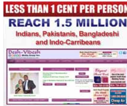
Square 330 x 330