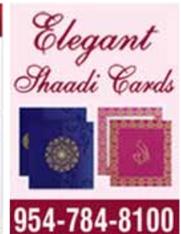
Medium Rectangle (160 x 220)