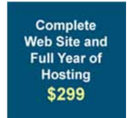
Small 160 x 160